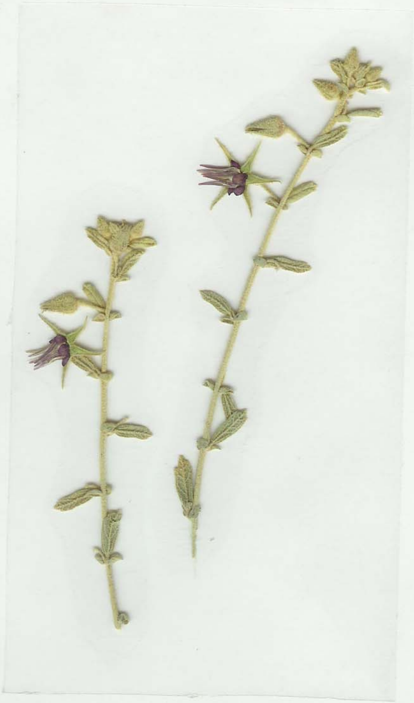
Hermannia minimifolia flowers