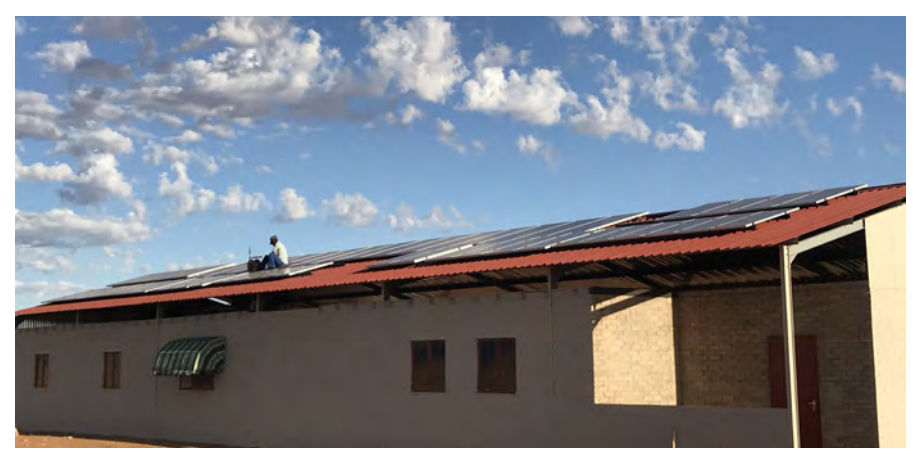
Die Duine Homestead shared storage facility with Solar panels for sustainable power