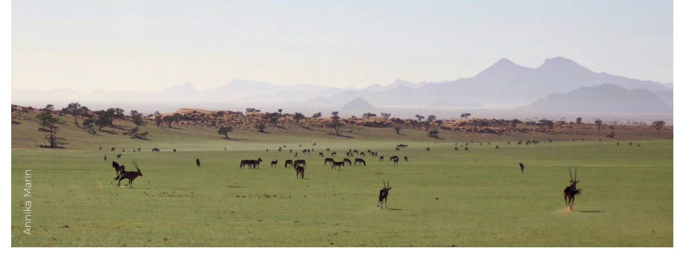
Animals returning, February 2020

Guests can also set off to explore on their own, always on the condition of not disturbing other guests either on foot, fat bike or on the self-drive, which is admittedly rather short, but includes some fun dune driving provided you let your tyres down. Getting rescued when stuck is costly.