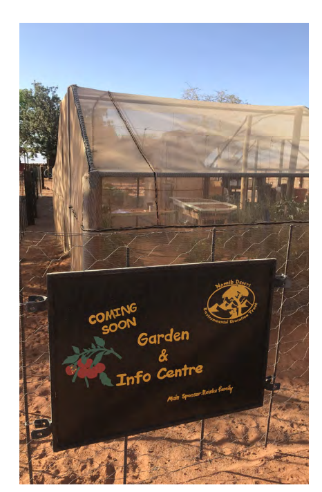
Big things coming to NaDEET