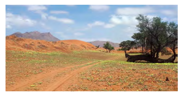
A hint of green, February 2020