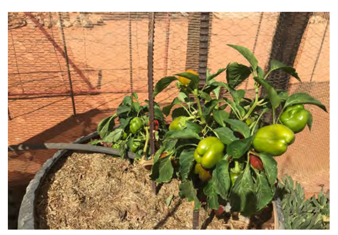
Harvesting homegrown peppers