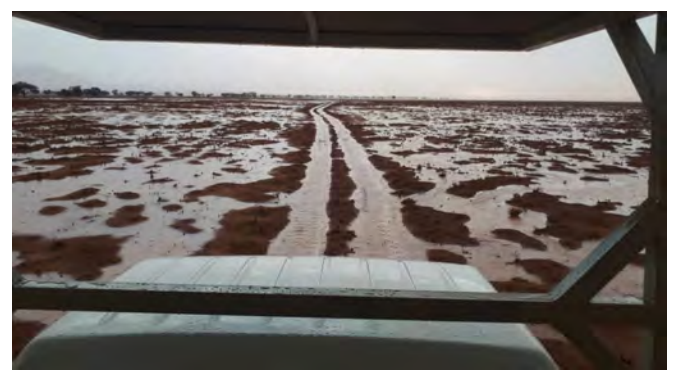
During the Storm, February 2020