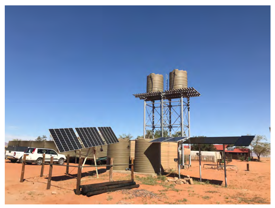
Water storage and borehole for the Die Duine Homestead